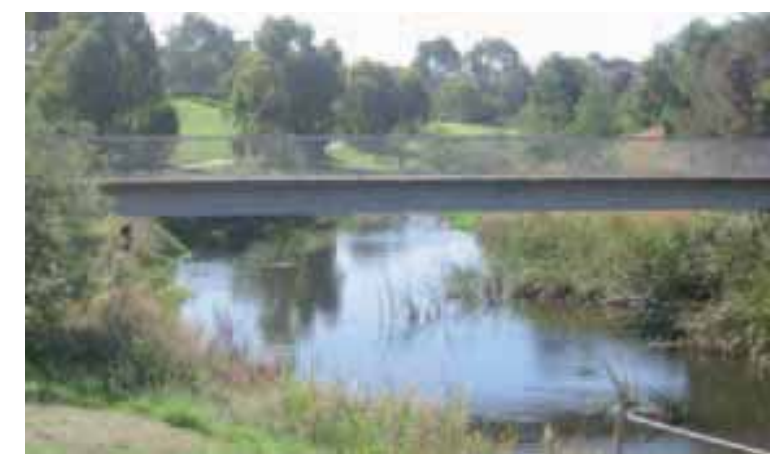
Figure 7: Footbridge over Kororoit Creek at the end of Billingham Road in Deer Park