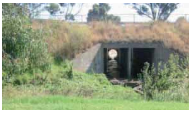
Figure 8: Jones Creek outlet into Kororoit Creek with the Western Highway running above