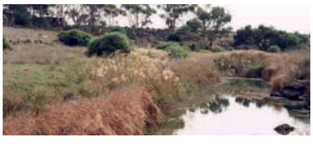
Figure 6: Kororoit Creek landscape near Beattys Road in Rockbank