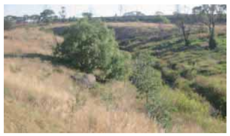
Figure 9: Kororoit Creek adjacent to More Park with the Western Ring Road beyond