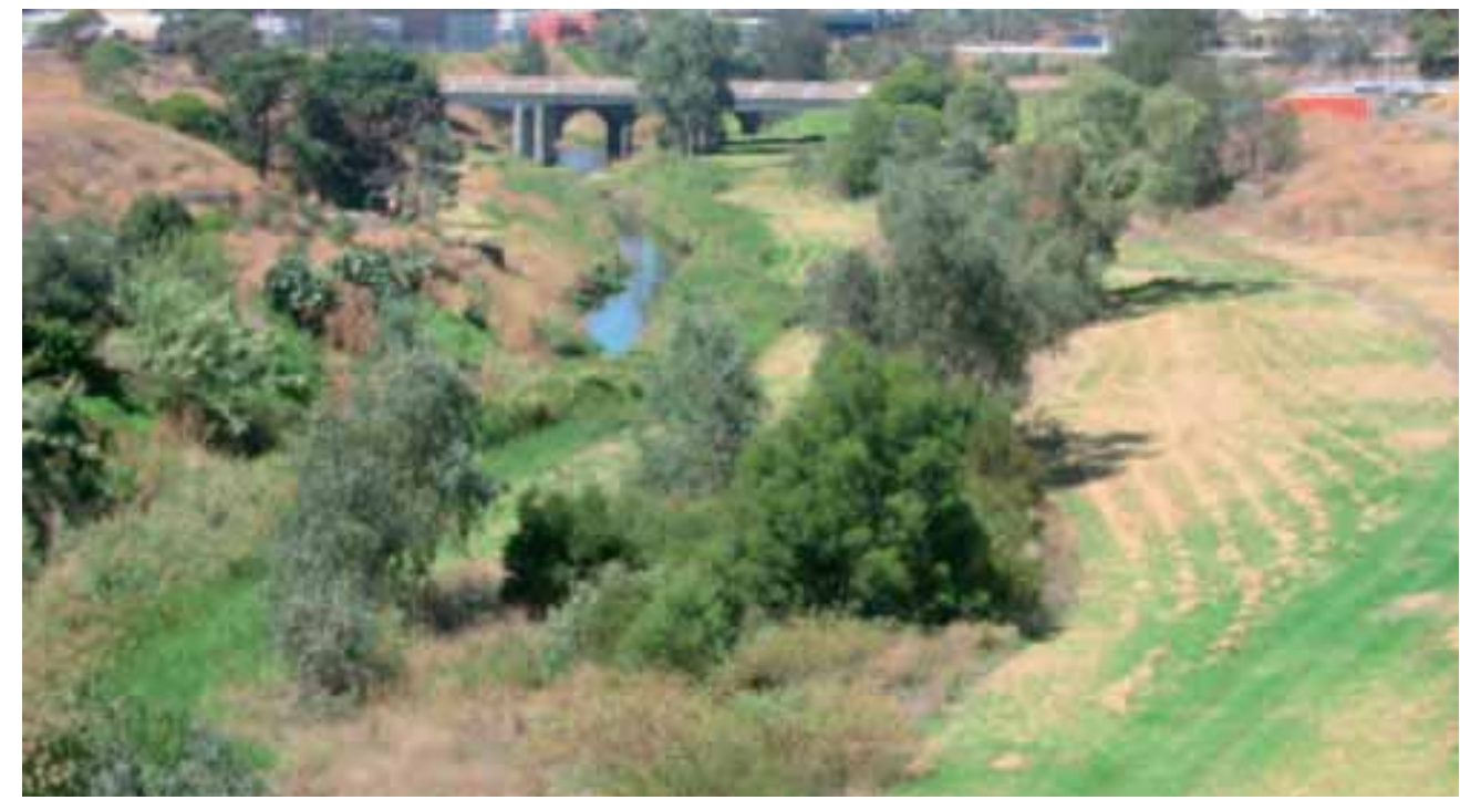
Figure 12: View south along Creek Corridor from Historic Sewer Outfall Bridge

Figure 14: Deep pools landscape in Sunshine