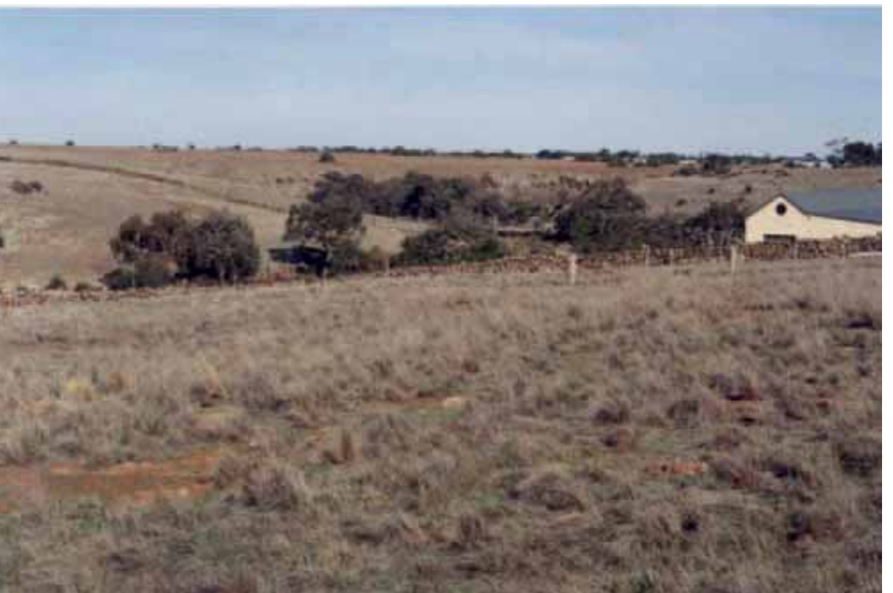
Figure 10: Kororoit Creek Farm near Mount Kororoit in Plumpton (left)

Figure 11: Semi-mature Eucalypt plantings along Kororoit Creek in Ardeer (below)